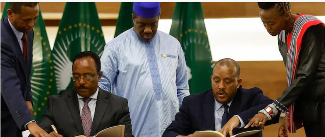
Redwan Hussein, left, representing the Ethiopian government, and Getachew Reda, right, representing the Tigray People's Liberation Front, sign a peace agreement after peace talks in Pretoria, South Africa, on November 2.

Unfortunately, the African Union has, as of this time, consistently failed to recognize or address the violence and instability inside Oromia.