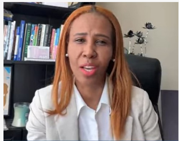
AADDEE SEENAA JIMJIMOO DAAYREEKTEERA OLLAA

International cooperation and solidarity will be key to ensuring that human rights are respected across Ethiopia and that humanitarian assistance is provided to all who need it. Therefore, the international community must come together and agree to apply uniform political and diplomatic pressure on the Ethiopian government. OLLAA recommends that the international community intervene with a measured and coordinated response to the human rights abuses perpetrated against Ethiopian civilians.